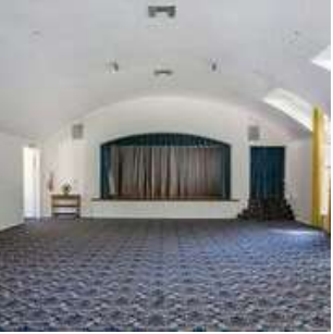
Hall & Theatre for Parties, Performances, and Celebrations