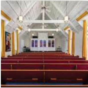
Sanctuary for Weddings, Celebrations of Life, and Sacred Events