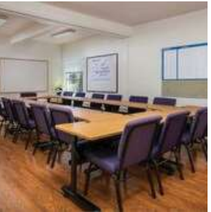
Classrooms and Conference Rooms are perfect for hosting your next meeting