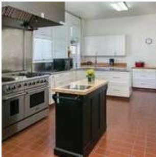
Kitchen can be rented for catering events or as a prep kitchen